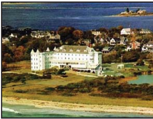
MARIE JOSEPH RETREAT CENTER (ON THE OCEAN)